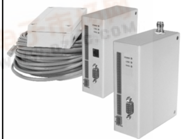
2.4GHz Analog/Digital I/O Wireless Modem

2.4GHz Analog/ Digital I/O Wireless Modem