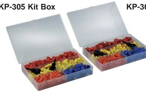
KP-305S Kit Box