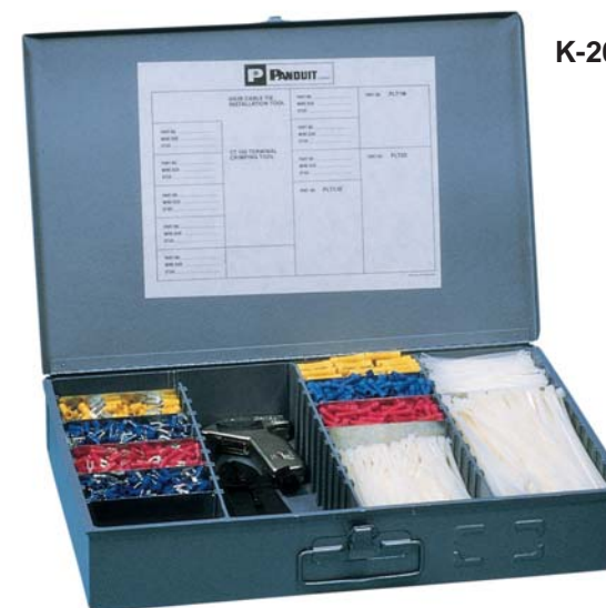
K-205 Kit Box