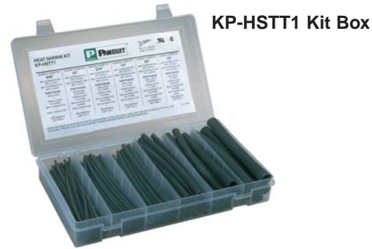
KP-HSTT1 Kit Box