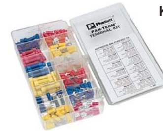
KP-1075 Kit Box