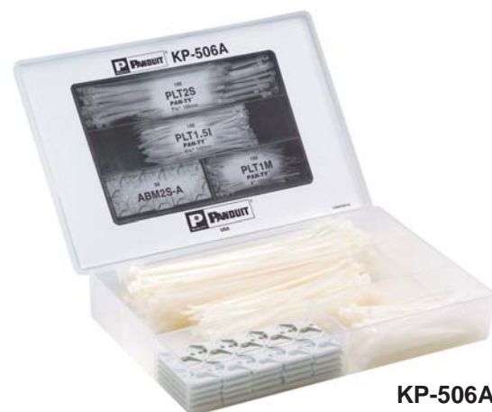
KP-506A Kit Box