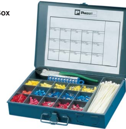
K-504 Kit Box

See below for storage slide racks and base.