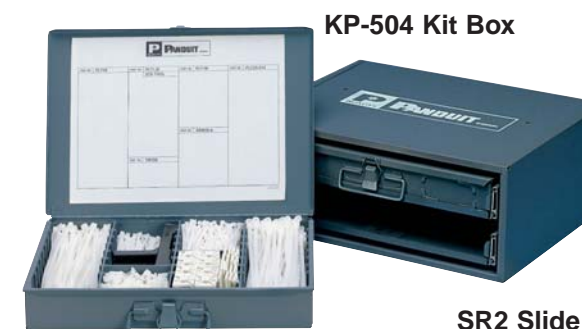
KP-504 Kit Box