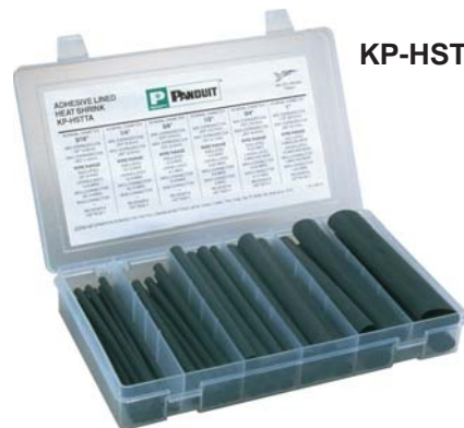
KP-HSTTA Kit Box

Note: Colors Include: Red, Yellow, Green, Blue, White, Clear and Black.