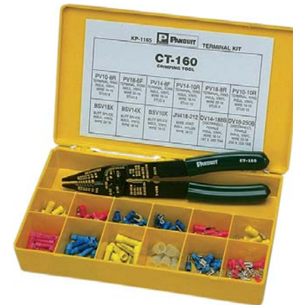
KP-1165 Kit Box

50 and 100 pc. terminal boxes available as refills. Refer to Terminal Catalog, SA-TM09CB01A.