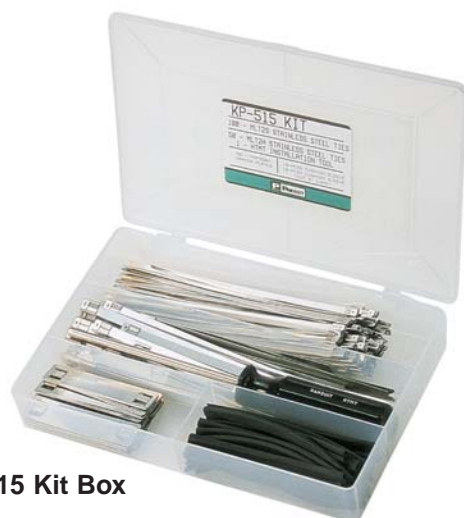
KP-515 Kit Box