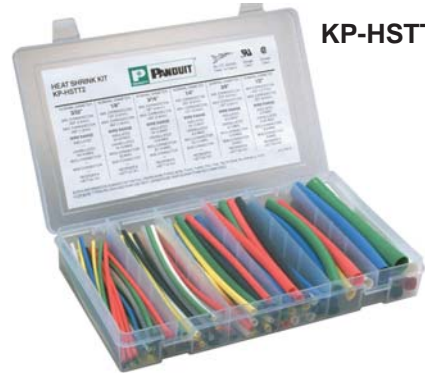
KP-HSTT2 Kit Box