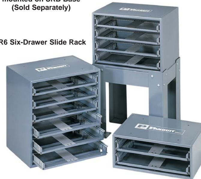
SR2 Two-Drawer Slide Rack

Base and slide racks are sold separately.