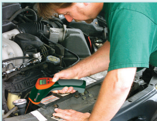
Measure non-contact surface temperature on automotive applications