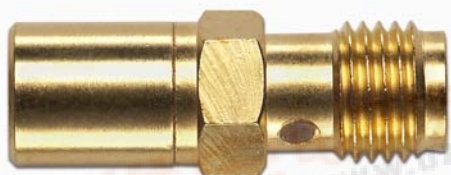
Model 72979 SMA (F) TO SMB (F)