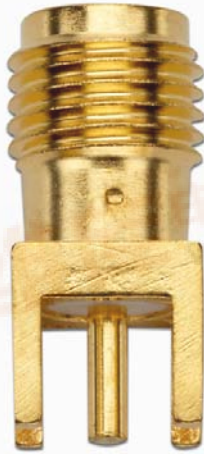
Model 72963 SMA JACK STRAIGHT PCB RECEPTACLE

High bandwidth, small size, and durability for confident connections.