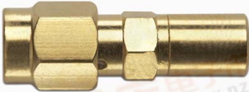
Model 72977 SMA (M) TO SMB (F)

High bandwidth, small size, and durability for confident connections.