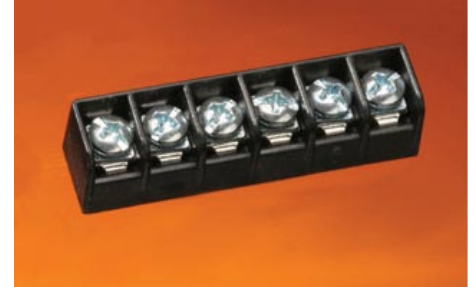
Single-Row Tri-Barrier Terminal Strip

Durable tri-barrier terminal strips are available with PC tails, our most popular terminal style, to accommodate a wide range of design requirements