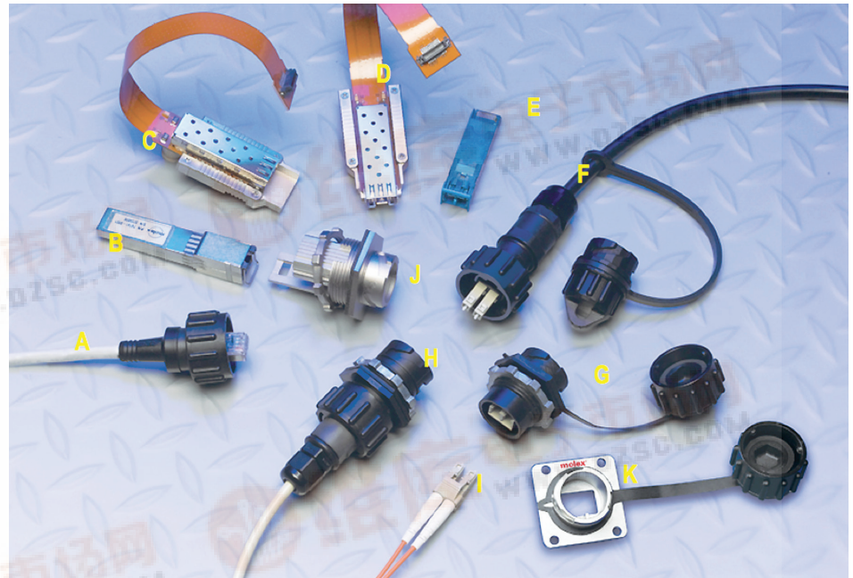
Left to right: A = Optical Industrial Ethernet Cable, B = Electrical RJ-45 to SFP Transceiver, C = Electrical Sealed SFP Module, D = Optical Sealed SFP Module, E = Optical SFP Transceiver, F = Industrial LC Cable Assembly with Cable Assembly Dust Cap, G = Industrial LC Adapter, H = In-Line Industrial LC Adapter Mated to an Industrial LC Cable Assembly, I = Duplex LC Cable Assembly, J = Sealed SFP Receptacle for Integrated Platforms C and D, K = Simplified SFP Receptacle

This unique interconnect system combines multiple components. The panel feed-through receptacle incorporates conductive-sealing gasketing, a panel nut and dust cap, which may be used with either an 'optical module' (see 'D' in photo) assembly or an 'electrical module' (see 'C' in photo) assembly. The removable 'module' assembly contains the SFP cage, power filtering, high-speed copper flex and PCB connector. When assembled to the receptacle, the module is contained within an environmentally durable, IP-67 grade (water and dust protection) industrial interface. The SFP receptacle, including the cage, is compatible with existing industrial cable assemblies, including ODVA* (Open DeviceNet Vendors Association), compliant Industrial Ethernet (copper CAT 5 cabling) and Industrial LC (optical duplex LC) assemblies. The SFP transceiver may be installed from either side of the receptacle, allowing for easy maintenance and upgrade of the SFP after the system is installed.