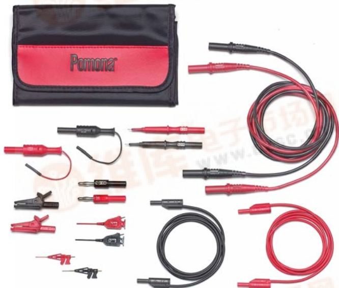
Model 72928 SMD Multi-Use Test Kit

Everything you need for SMD Test with your DMM in one kit